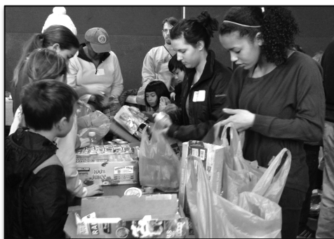
Volunteers packed about 1,300 lunch sacks for school children on Jan. 20 at the Martin Luther King Jr. Workday and Remembrance.

Every week during the school year, program volunteers put a weekend lunch sack in the backpacks of 167 identified at-risk students at Harvey Scott, King and Woodlawn schools and at the Tina Clegg Head Start Center. This all-volunteer nonprofit organization, which was started in 2008 by four local United Methodist congregations, relies on food