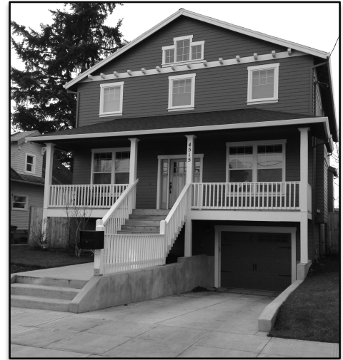
Firenze Development Inc. built a similar home (above) to what is planned for Northeast 14 th Ave. south of Beech.

Prices for each of the six new three-level, 2,580-square-foot homes could range in the mid-$500,000s, depending on market value at the time of sale, Kusyk explains. Homes will include a garage on the bottom floor with storage and wine cellar. The main floor will contain living areas, and the top floor will have bedrooms and baths. Rooms