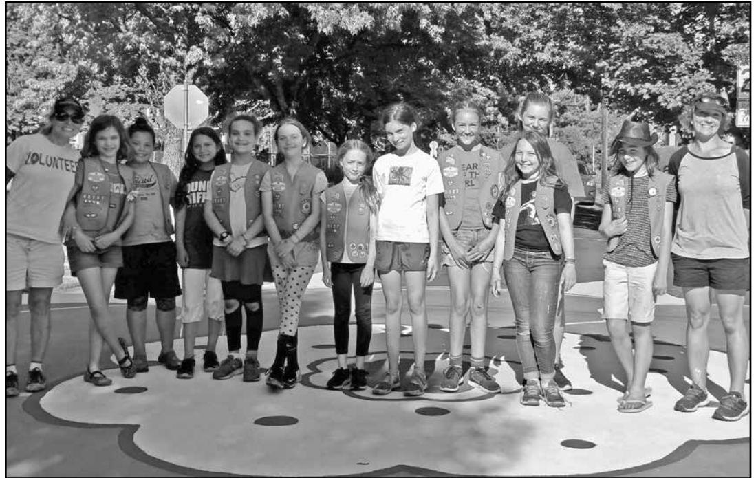
Girl Scout Troop 45157 members stand at the intersection of NE 17th Avenue and Failing Street, the site of their completed intersection painting project for the prestigious Bronze Award.