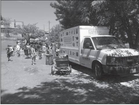
Volunteers gather at the Maranatha Church for the 2015 SCA Clean-Up.

Few chores are as satisfying as tackling a thorough household spring cleaning and de-cluttering, especially after years of accumulating no-longer needed stuff.