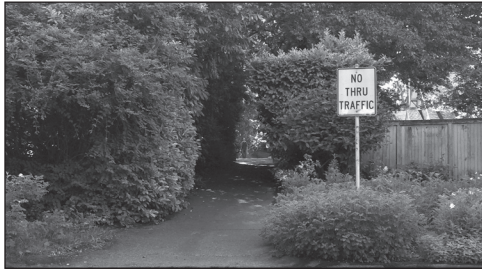
A view of Klickitat Mall at 14th Avenue.

er explains that some fencing, plants, and other structures on abutting property encroach into the public right-of-way.