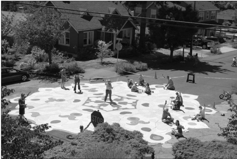
On Sunday, July 24, 2016, community members painted the intersection at NE Skidmore Street and 16th Avenue with a design inspired by an Islamic mandala.

Many residents may notice that another intersection painting appeared this summer, adding to Sabin’s growing collection of street art. A group of Sabin residents organized the place-making event through City Repair Project, a mostly volunteer organization that promotes community building through art.