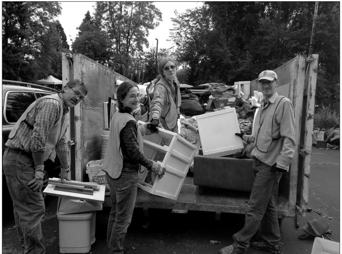
Sabin Community Association volunteers load items in a waste box during the May 21, 2016, clean-up event held at the Maranatha church parking lot. The Sabin Clean-up benefits the neighborhood by providing a place to bring unwanted items for recycling, reuse, and disposal.

The Sabin Community Association held its annual clean-up event this year on Saturday, May 21, and thanks to many new and returning volunteers, the event was a great success. The clean-up is sponsored by the NE Coalition of Neighborhoods, the City of Portland Bureau of Planning and Sustainability, and Metro, which provided free waste disposal.