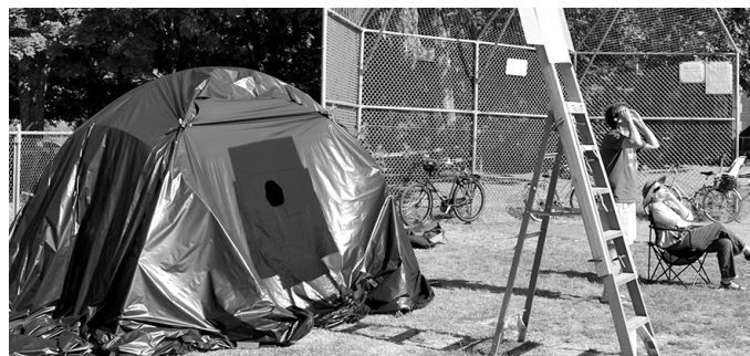
The Camera Obscura (or giant pinhole camera)

We have a program called Map Your Neighborhood to help you and your neighbors outline the necessary steps to take immediately following a disaster to help prevent injury and loss of property. For details, contact sabin.netpdx@gmail.com .