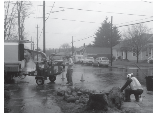
The King-Sabin Street Tree Community Assistance Project used their grant to remove and replace severely damaged trees in six Sabin neighborhoods.

In 2016, the Sabin Community Association developed a small grant process to solicit ideas from community members about how to improve our neighborhood. Residents in Sabin and nearby neighborhoods submitted ideas, SCA then invited a few to submit proposals. In 2017 SCA awarded two $1,000 grants; one to the King-Sabin Street Tree Community Assistance Project; and the other to the Sabin Neighborhood Emergency Team (Sabin NET) Emergency Equipment Cache. Each of these projects fulfilled a number of the SCA's guiding principles: Engaging the community, seeking to understand and meet community needs, supporting diversity, encouraging local businesses, preparing for the future and supporting sustainable living, caring for our natural environment, and partnering with community organizations.